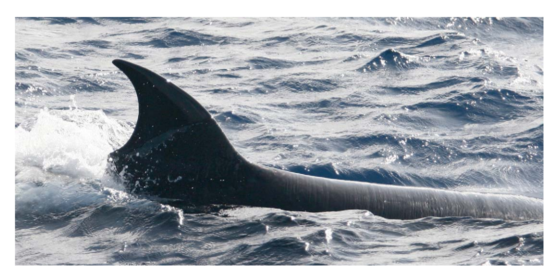
FIGURE 4. Photo of the dorsal fin of a sei whale seen 16 November 2007. The "jointed" shape of this dorsal fin is characteristic of the species (see text).