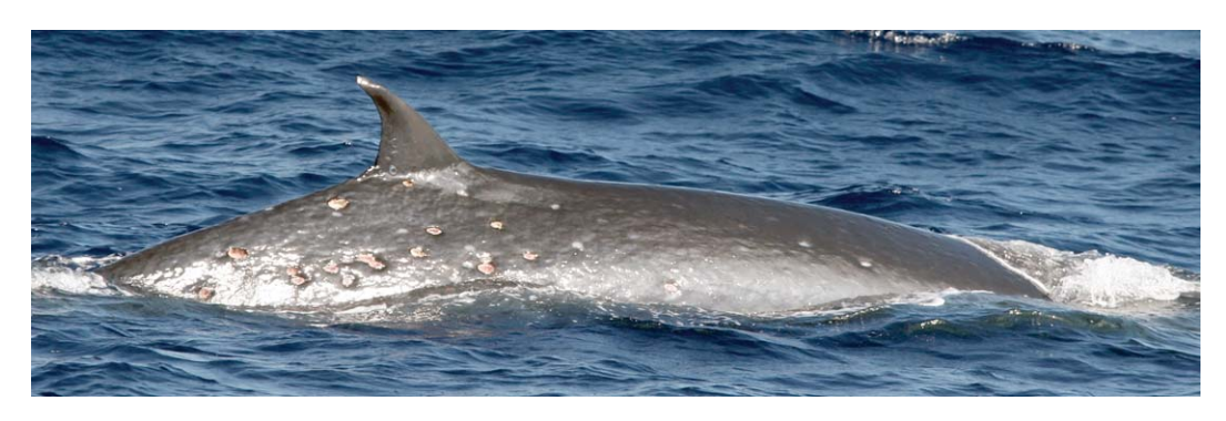
FIGURE 5. Photo of a Bryde's whale seen 13 November 2007 showing presumed cookie-cutter shark bite scars on its lateral body. Note the difference in dorsal fin shape between this Bryde's whale and the sei whale dorsal fin in Figure 4 (also see text for species diagnostics).

bow wave (Table 1). The surfing behavior we observed was attributed to the relatively large swells that day (0.9–1.5 m) and the movement of the observation vessel through the water and swells. Our observers had never seen this continuous repetitive, "leisurely" "surfing" behavior among sei whales, nor has it been reported to occur in the literature. However, sei whales appeared to "surf" swells frequently during a 4-month vessel survey in the Mariana Islands during winter 2007 (R. Rowlett, pers. comm.).