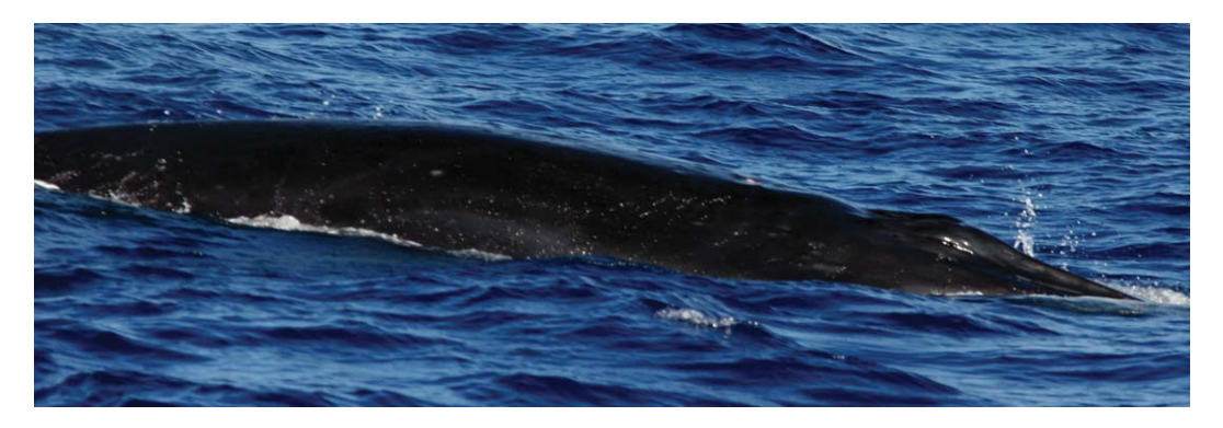
FIGURE 1. Photo of a Bryde's whale seen 13 November 2007 showing the presence of auxiliary rostral ridges, a diagnostic characteristic unique to this species (see text).