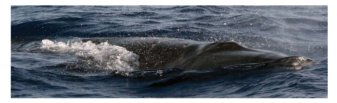
FIGURE 2. Photo of a subadult sei whale seen 16 November 2007 showing the lack of auxiliary rostral ridges. Several apparent cookie-cutter shark bite marks can also be seen.

records (Jefferson et al. 2008), and there is continued confusion and lack of species verification associated with many reported Bryde's and sei whale records. Furthermore, their underwater vocalizations have only recently been verified and only in a few areas (e.g., Gedamke et al. 2001, Oleson et al. 2003, Rankin and Barlow 2007). Consequently, corroborated identification data differentiating these two species are important to further understand their populations and life-history patterns, particularly for the sei whale, which is listed as Endangered under the U.S. Endangered Species Act (ESA).